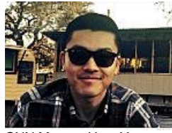
CNN Money: How Young Millionaires Invest (CNN Money)