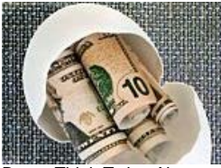
Better Think Twice About That Mortgage Payment