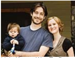
Little Known Way To Pay Off Mortgage (Daily Mortgage Monitor)