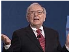
Warren Buffett Reveals How Anyone With $40 C... (The Motley Fool)